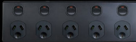
Order code: PUBIG5MBK