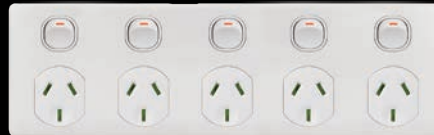
Order code: PUBIG5MW