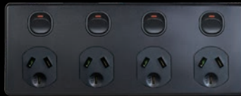
Order code: PUBIG4MBK