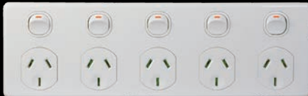
Order code: PUBIG5