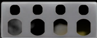
Order code: PUBIG4CA