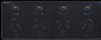
Order code: PUBIG4BK