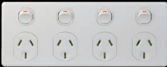
Order code: PUBIG4

Ready for all Kitchens, Bedrooms, Offices, Entertainment Areas and Workshops.