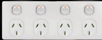
Order code: PUBIG4MW