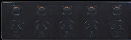
Order code: PUBIG5BK