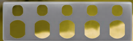
Order code: PUBIG5CA

PUBIG4 & PUBIG5 NOW ALSO AVAILABLE WITH ALUMINIUM 'LOOK' COVERS