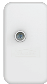
HYJB43T 41mm (w) x 73mm (h) x 26mm (d)