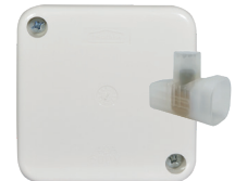
HYJBS4T 70mm (w) x 70mm (h) x 35.5mm (d)