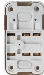
HYJB43T (Back view)