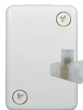
HYJB4TF 68mm (w) x 99.5mm (h) x 47.5mm (d)