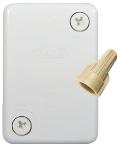
HYJB4TFT 68mm (w) x 99.5mm (h) x 47.5mm (d)