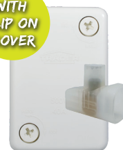
HYJB4TFC 68mm (w) x 99.5mm (h) x 47.5mm (d)