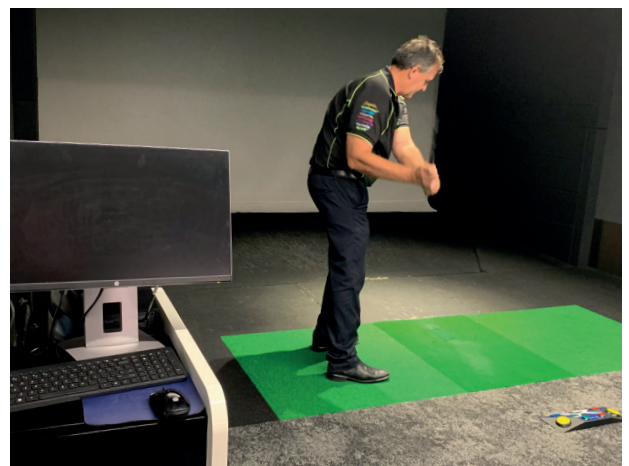
Flat Cat black used extensively through amenities including virtual golf.