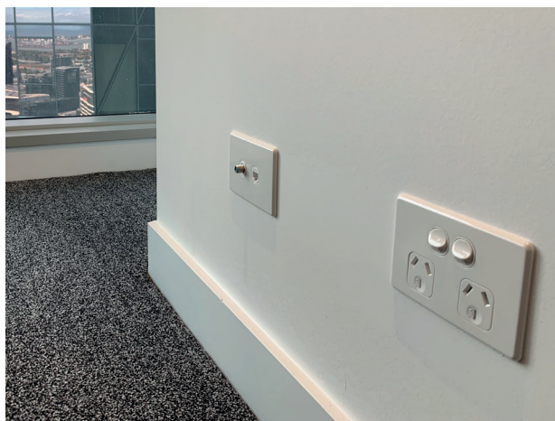
Full range of TV jacks and data accessories available.