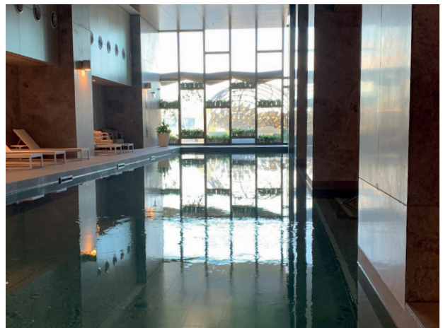
Luxurious pool for residents only.