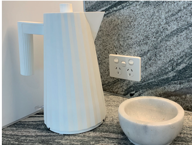
Flat Cat complements stone benchtop, splashback and accessories.