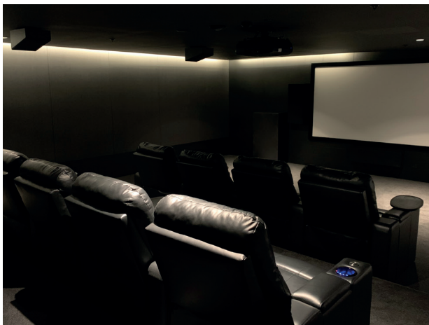
Black power point and switches used in home theatre area.