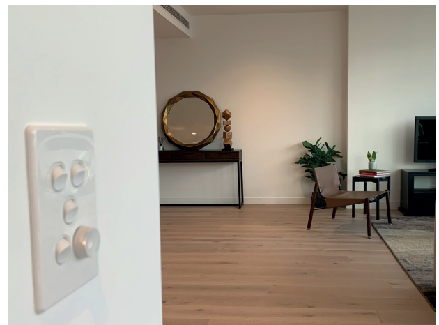
At 4mm thin, Flat Cat is among the slimmest switch and power point ranges available

The West Side Place Apartments are a great example of how Trader can deliver on a solution for multi-storey apartments and residential locations. If you have a similar project that you would like to discuss with Trader, please reach out to us.