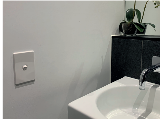
Bathroom luxuriously appointed.