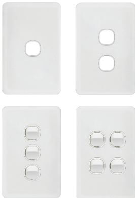
Images above show Senoa Simple plates using rocker mechs