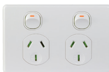
Puma Double Power Point PUPP2G