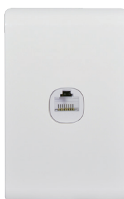
Example of cover plate with MERJ6CM data mech installed