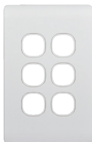
Example of cover plate only / grid and plate only (less mech)