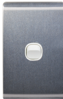
Example of cover plate with LEPPSW1GCBA with LEPPSWV1G