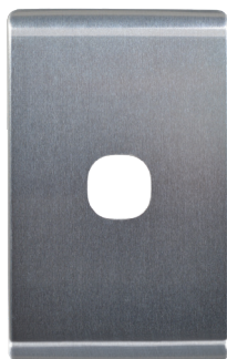
Example of cover plate LEPPSW1GCBA