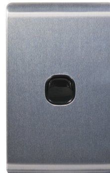
Example of cover plate with LEPPSW1GCBA with LEPPSWV1GBK