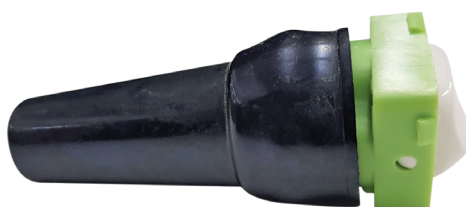
HYSWSHR Pictured with mech for example purpose