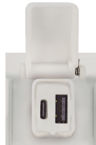
USB Type A & C