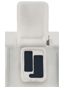
USB Cover under flap for when USB's not in use.