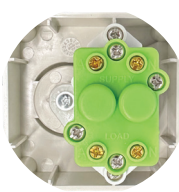
Example of cover mounted switch HPISW220

Spraying cleaning products on to electrical products is not recommended.