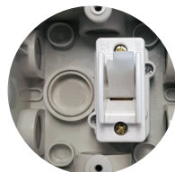
Example of internal HPISW120 switch (base mounted)

*See current catalogue for further detail