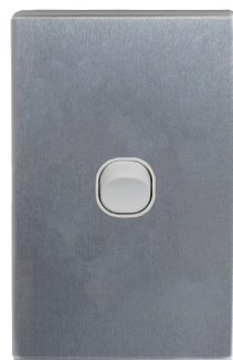
Example of cover plate with FLPPSW1GCBA with FLPPSWV1G