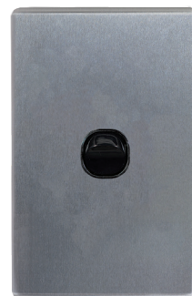
Example of cover plate with FLPPSW1GCBA with FLPPSWV1GBK