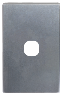
Example of cover plate FLPPSW1GCBA