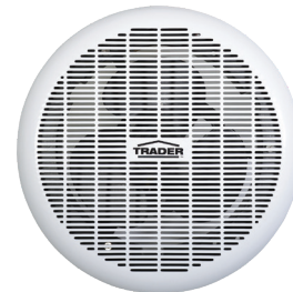
Easy to Clean Grille