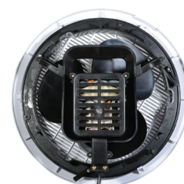
High Performance Ball Bearing Motor