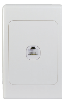
Example of cover plate with MERJ6CM data mech installed