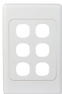
Example of cover plate only / grid and plate only (less mech)